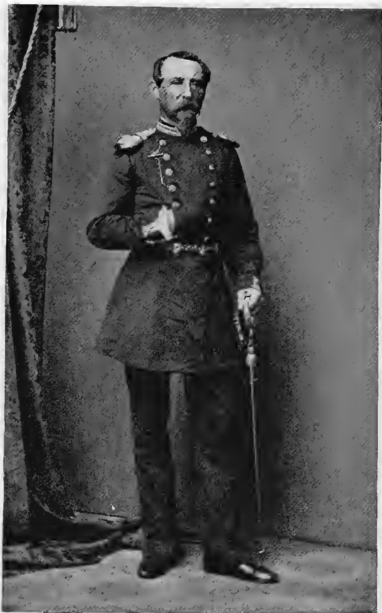
COLONEL ERNST VON VEGESACK